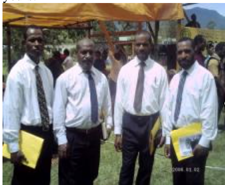
The four proud and excited recipients of the CCF awards posing for a photo with their awards.

A new milestone for CLTC TEE when it saw four students graduating with a Certificate of Christian Foundation Awards for the first time in the CLTC annual graduation last year (2009). We encourage all our CCF students, its' a challenge for you now that you should strive to obtain yours.