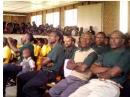
Photo Below is an audience in a church packed to its' capacity at a TEE graduation in the Western Highlands Province.

In the outset I would like to remind us that, DTE would really appreciate it, if you would invite us to your TEE graduations. We can share the cost of transportation, CLTC one way and the host one way. This is classified as a very important occasion where we witness fruit of hard work.